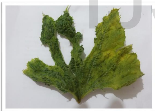
Figure 1. Deformity symptoms on squash leave.

In the field studies, symptoms such as chlorosis, banding in the veins, blistering, curl, shrinkage, thread, asymmetry of the leaves, stunted shoots and superficial protrusions, deformation, mottling and shrinkage of the fruits and similar virus symptoms in some cucurbit plants were observed (Figure 1, 2).