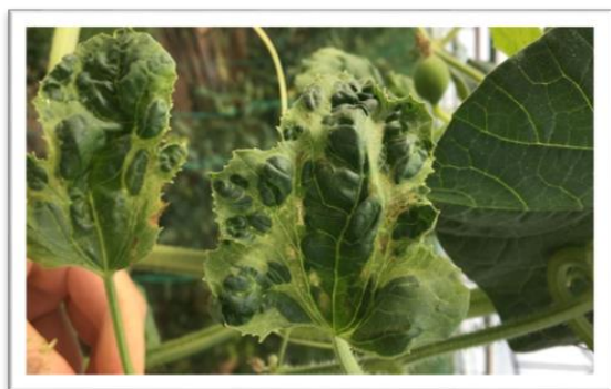
Figure 2. Deformation and curling symptoms on cucumber leaves.

(60.00%) of 175 cucumber plant samples were found to be WMV-2 positive (Figure 2).